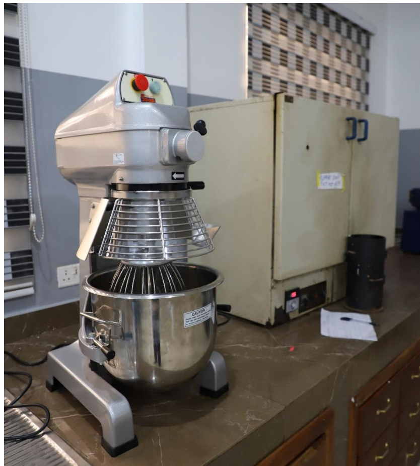
Figure 14: Planetary Asphalt Mixer