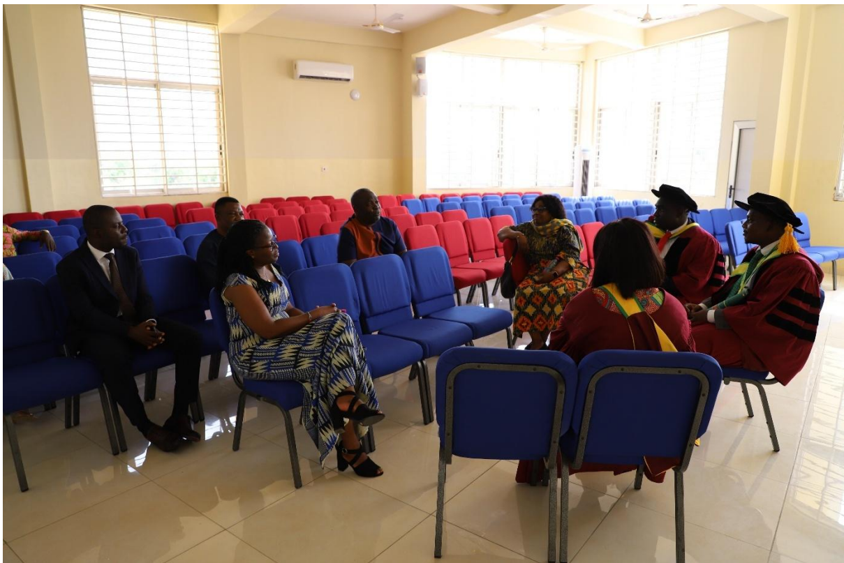
Figure 10: Auditorium