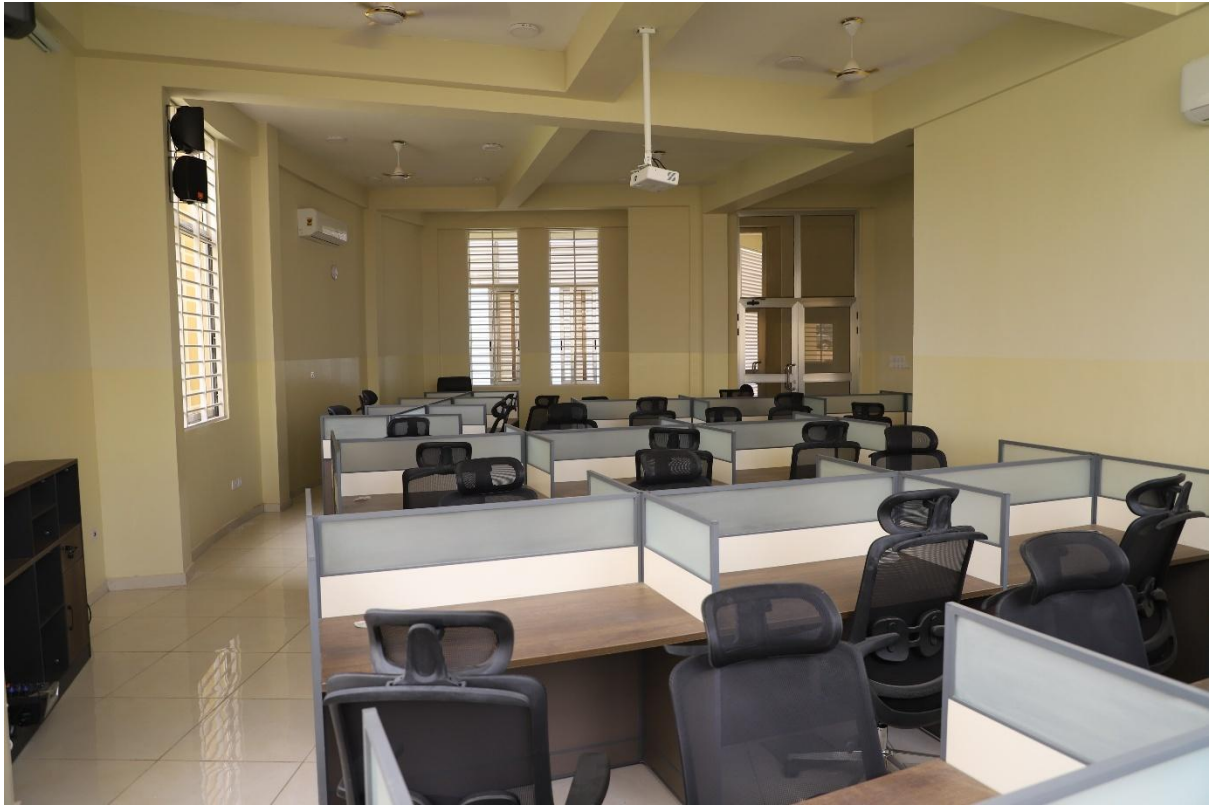
Figure 1: Research Commons (Masters)