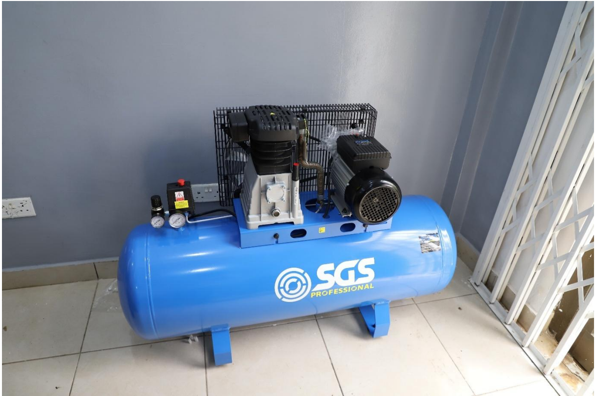
Figure 15: Air Compressor