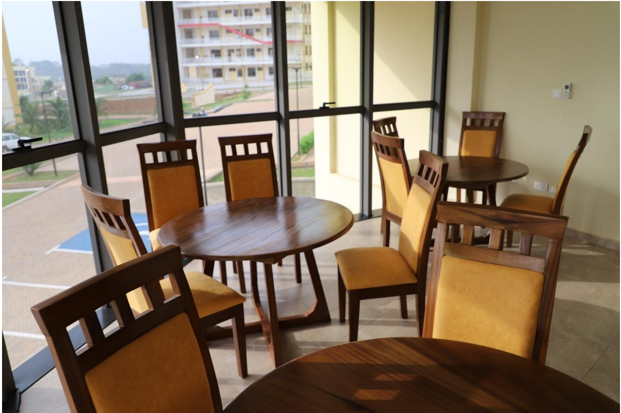
Figure 7: Meeting Room