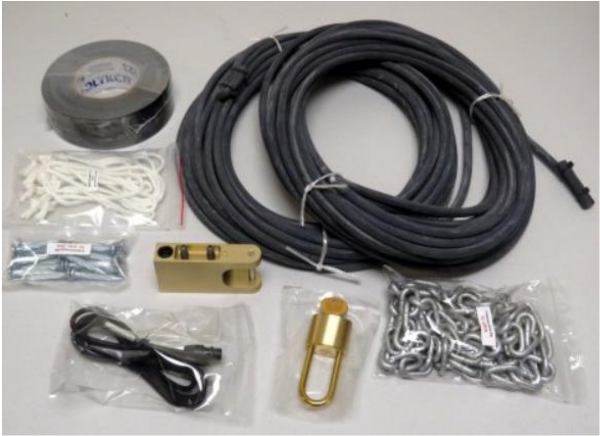
Figure 17: Pico Count 2500