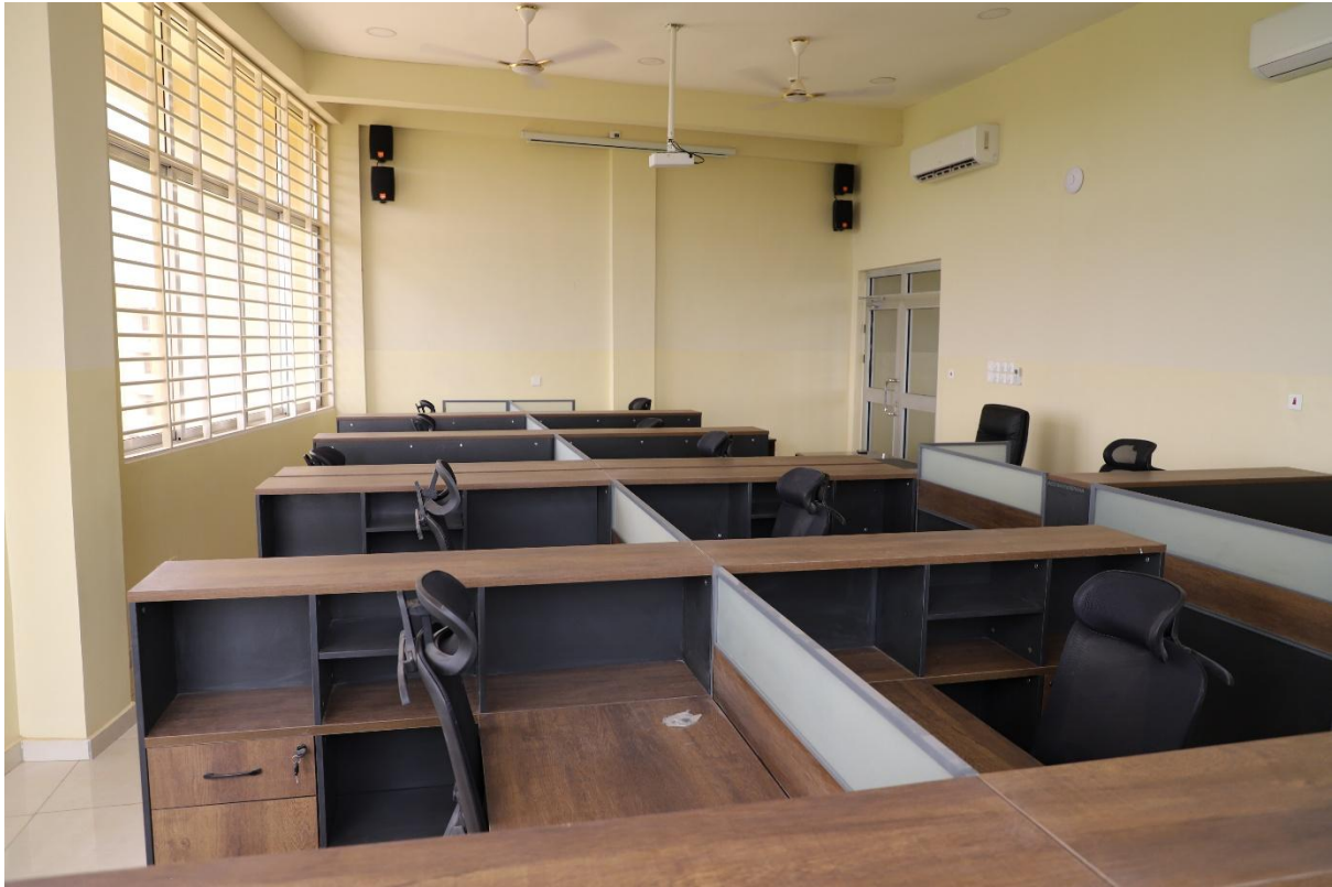
Figure 3: Research Commons (PhD)