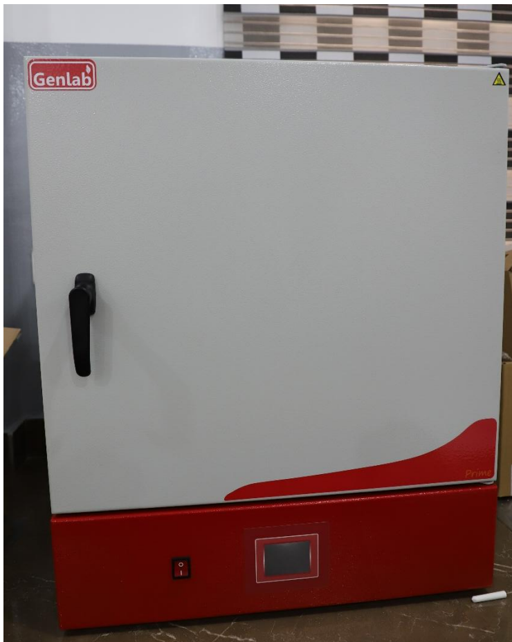
Figure 20: Oven 50°C to 300°C