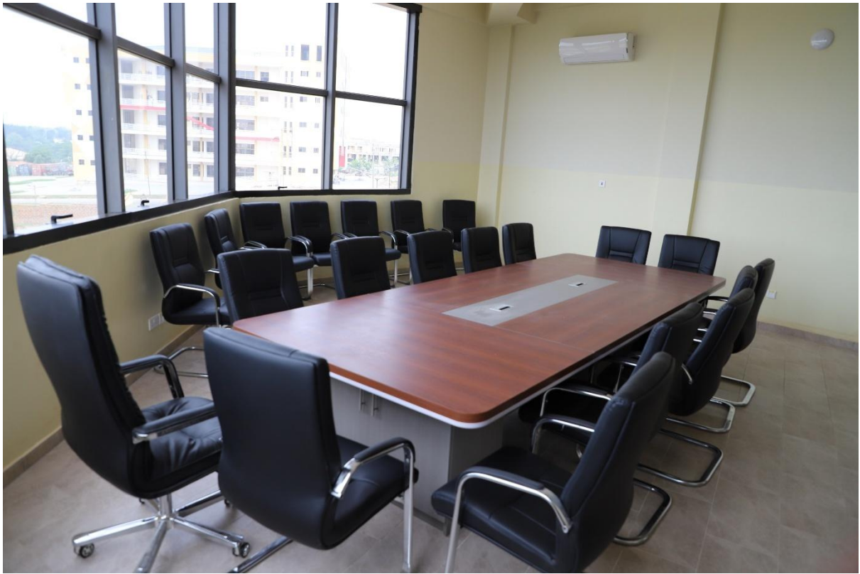
Figure 5: Board Room