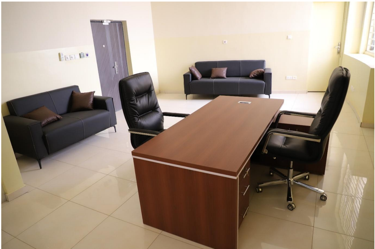
Figure 8: Director's Office