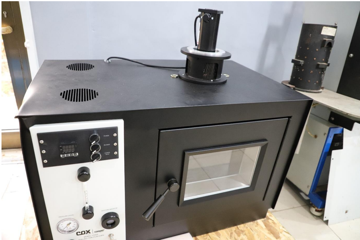
Figure 13: Asphalt Rolling Thin Film Oven