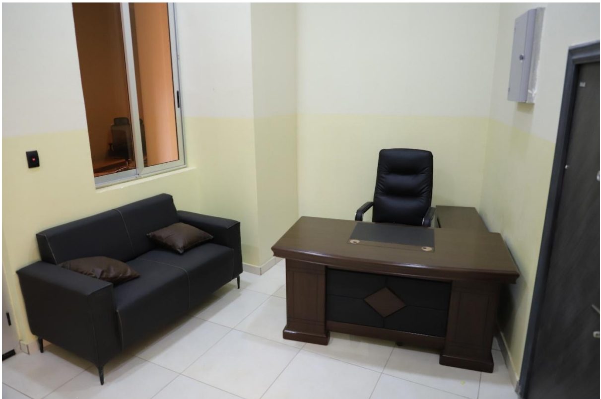
Figure 6: Reception