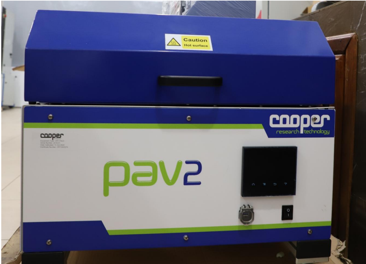
Figure 19: Pressure Aging Vessel