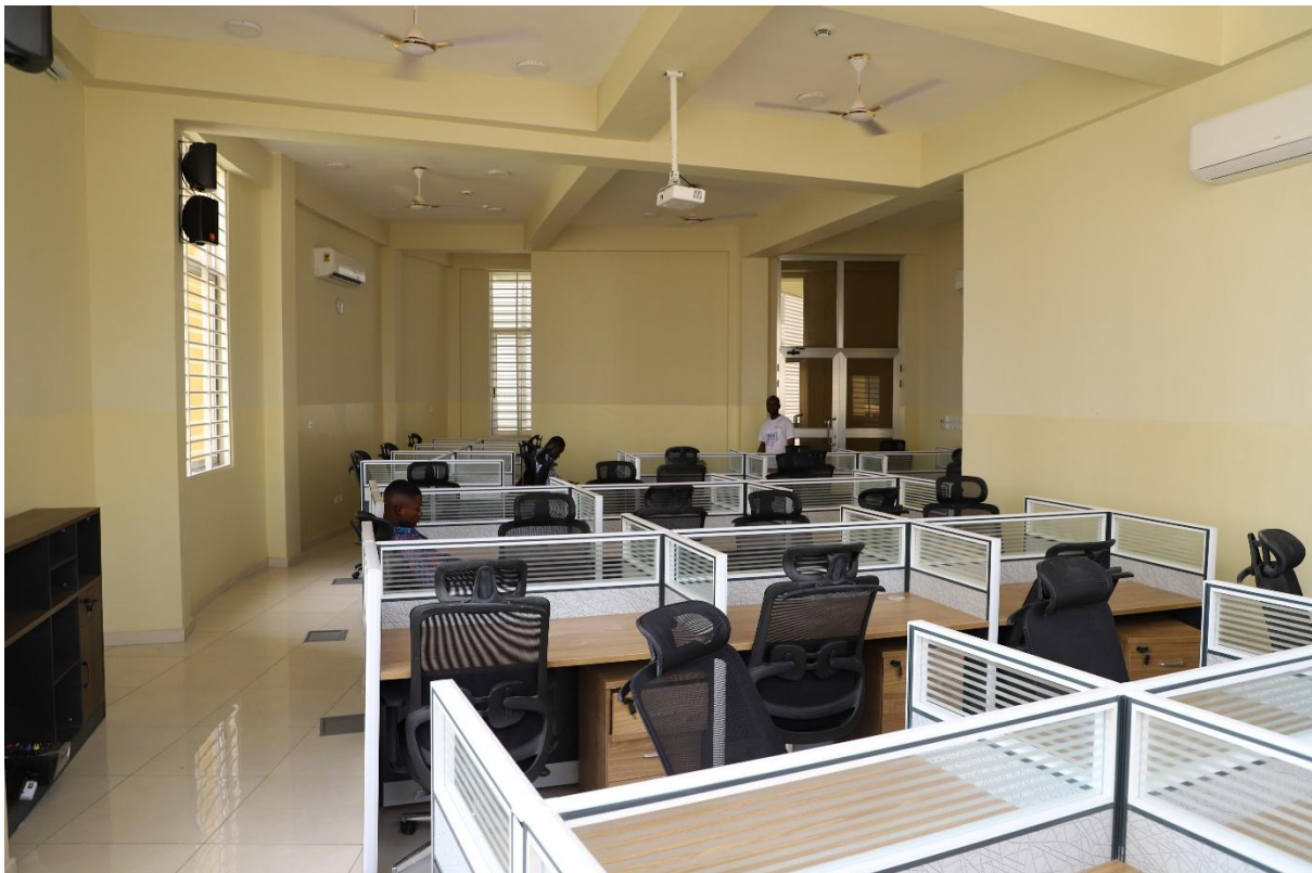
Figure 4: Traffic Engineering and Simulation Lab