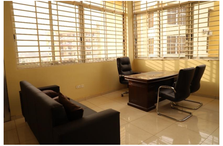
Figure 9: Offices