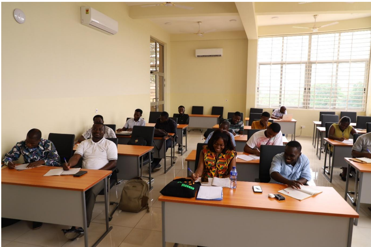
Figure 2: Lecture Room