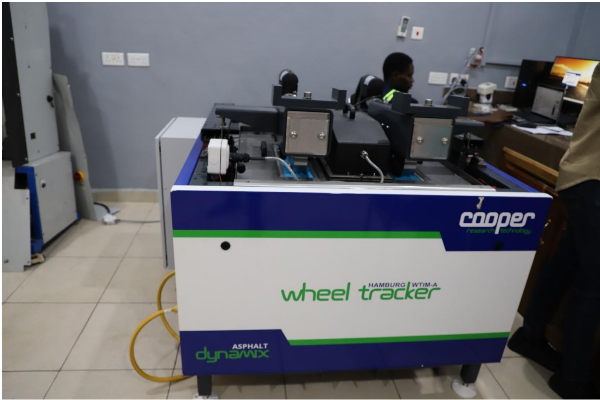
Figure 11: Hamburg Wheel Tracker