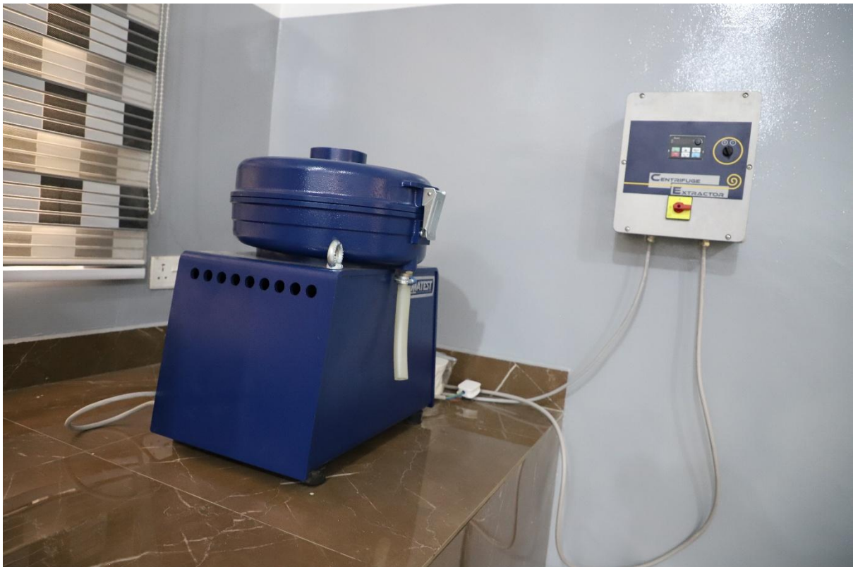
Figure 12: Centrifuge Extractor (Bitumen) Explosion Proof