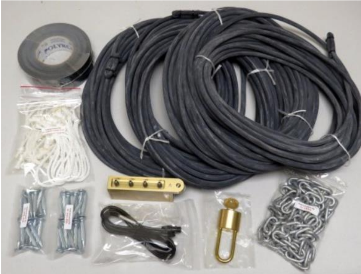
Figure 18: Pico Count 4500